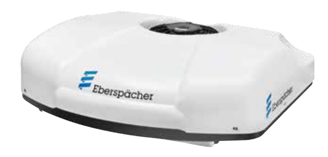
Fig.: Cooltronic 1000/1400 G2.5 Hatch

Eberspächer has been optimising climate control solutions in vehicles for decades. In addition to satisfying our customers' demands for comfort and safety with our innovative heating concepts for passenger cars, commercial vehicles, boats and motor homes, protecting resources is also a top priority for us. This allows us to help ensure that transport systems are highly efficient, even when resources are in short supply. The aim of cooling vehicle interiors without the use of the engine is to create the best possible working atmosphere at a reasonable cost. This enables us to make an important contribution to reducing costs for transport companies, for example.